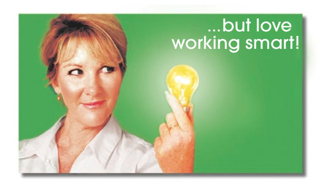
Business Accountability Delivered Are you ready?

3100 W. Burbank Blvd, Suite 101 • Burbank, CA 91505 • Tel: 866.677.8275